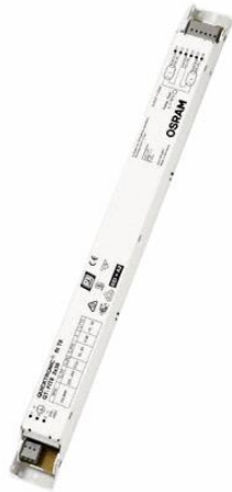
QT-FIT8 2X58-70/220-240 VS20