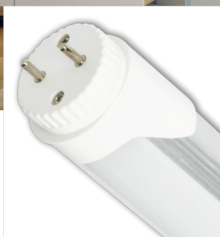
WITH SPIN BASE